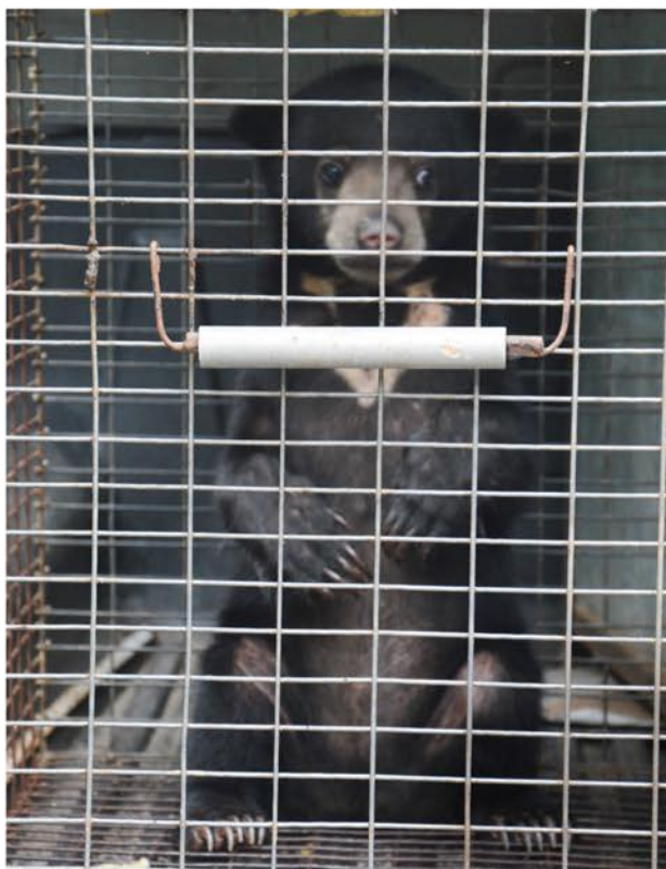
Arrival of Bintang at BSBCC. She was quite traumatized being kept as a pet in a small iron cage.

Previously, when little Bintang was moved to the quarantine area during her first arrival at BSBCC, she was not very welcomed by Sunbearo as Sunbearo kept growling repetitively at her. Therefore, during the first integration between Bintang and Sunbearo, our team observed them with extra caution and were prepared for any sudden aggressive fight between these two sun bear cubs. Luckily, after opening the sliding gate between their dens, Sunbearo was the first to initiate the play and it was Bintang first contact with another bear. Both of them spent most of their time playing at the small platform and basket.