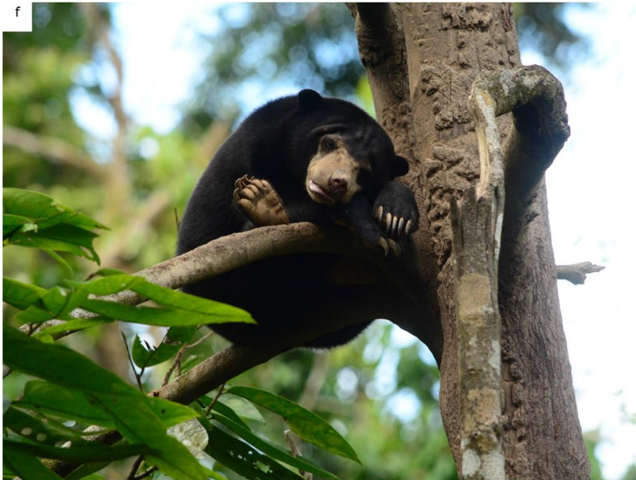
f) Bintang taking nap on a tree branch in the BSBCC forest enclosure.