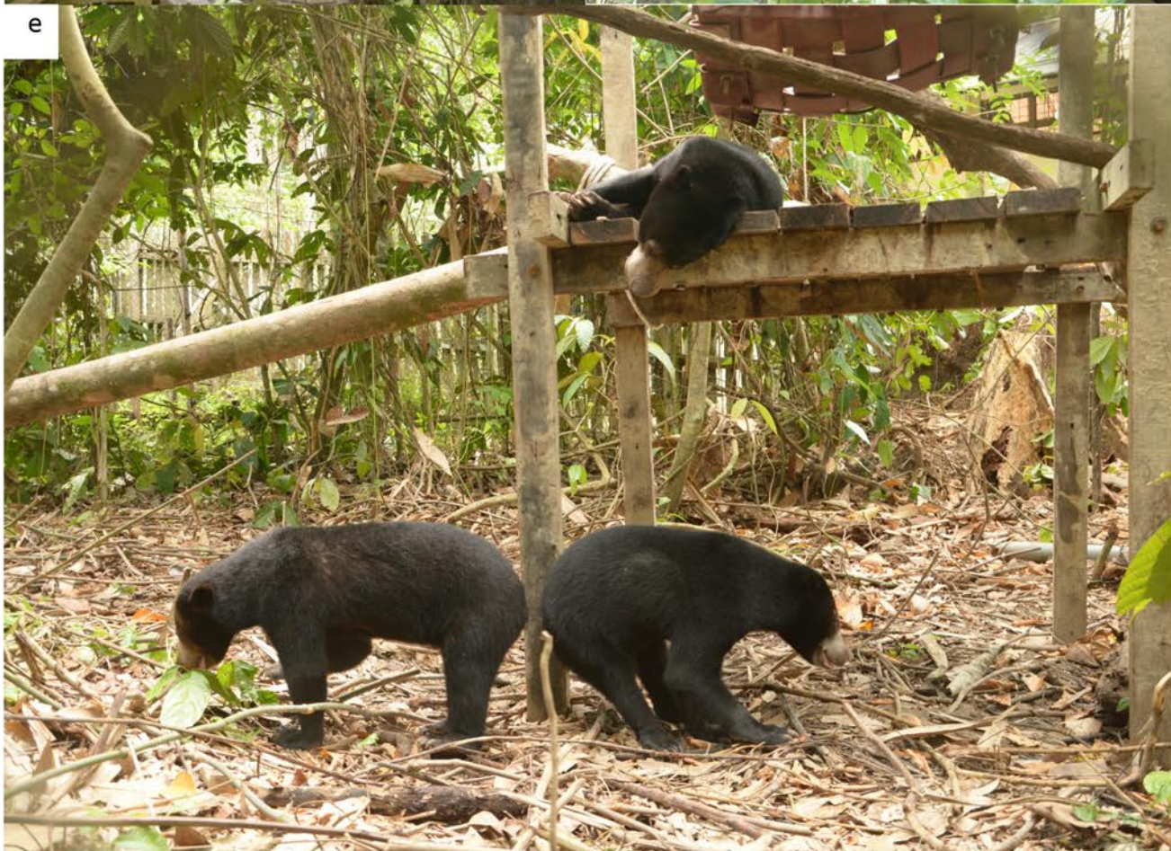
a) Bintang enjoying her time on a hammock. b) It is a play time for Sunbearo (left), Loki (middle) and Bintang (right). c) These three little bears peek out from the indoor bear house. d) Finally, Bintang stepped out into the forest enclosure. e) Bintang (bottom right) and another two bears observing their surrounding environment.