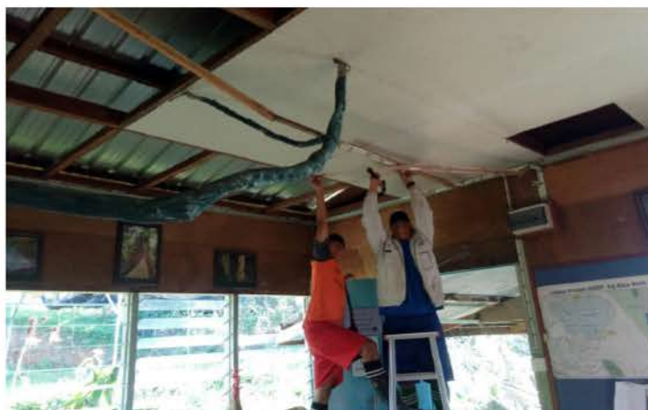
Workers are changing the ceiling