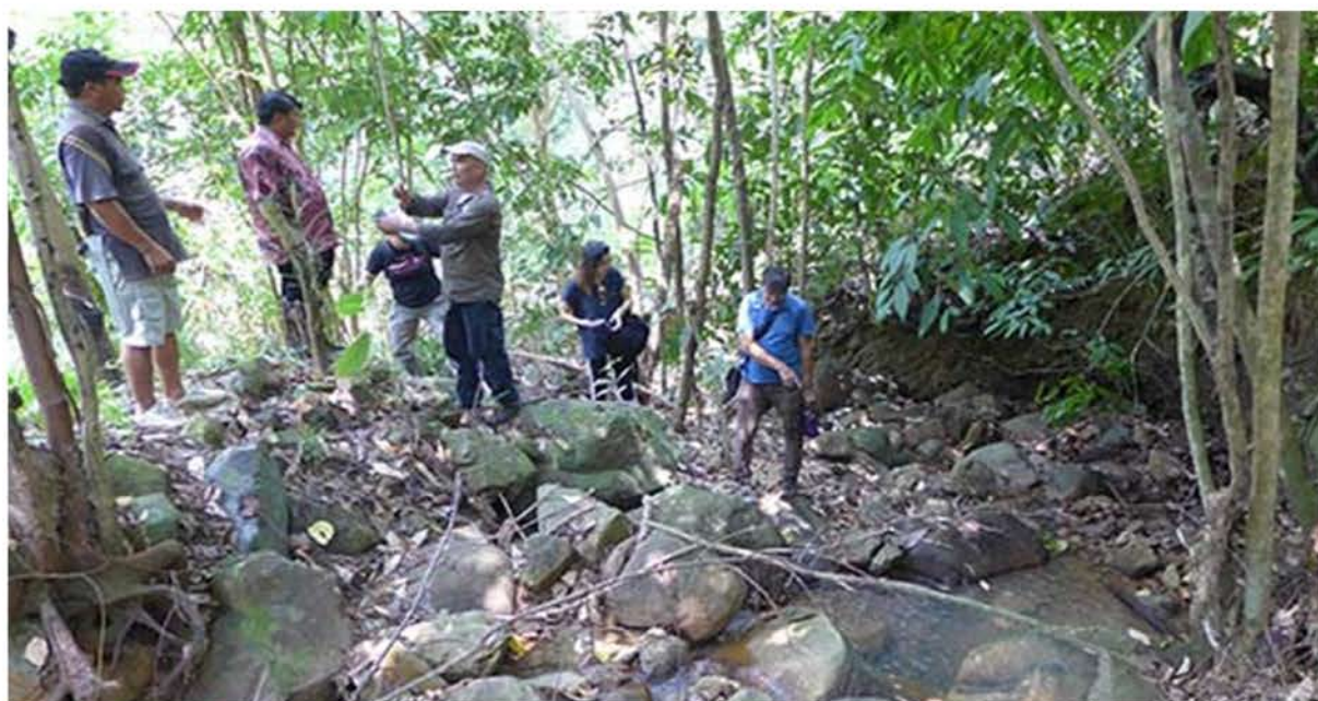
The water source from hill

inches and 300M of 3 inches poly pipe for the connection to the 400 gallons tanks with 2 units of 1000 gallon tanks near to Pastor Francis' house. It was agreed the villagers will provide the labour while BEST will provide the materials.