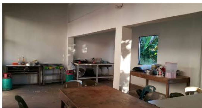
ABJC Hostel – Kitchen (After)