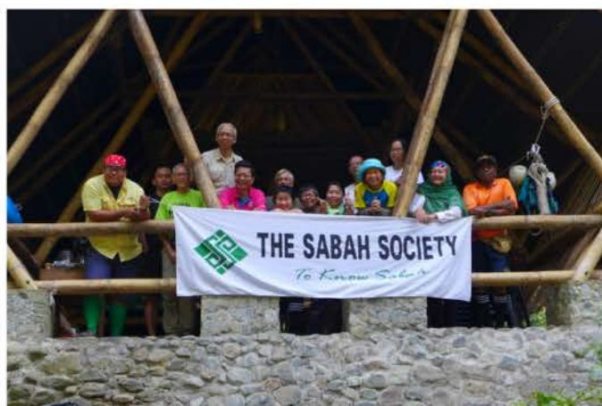
Group from Sabah Society