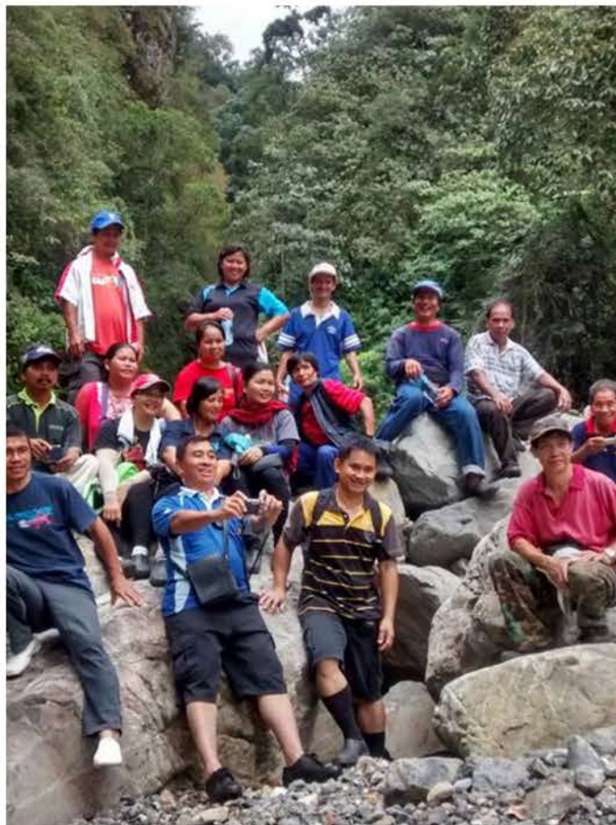
Local villagers from Kiulu Farmstay at Minitinduk Gorge