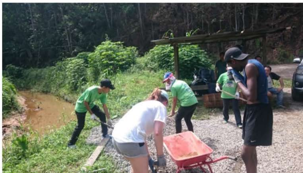
Volunteers working together regardless of different background