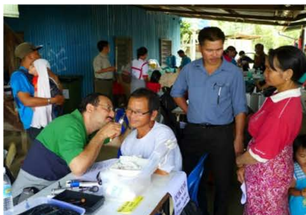
A villager getting a free ear check-up