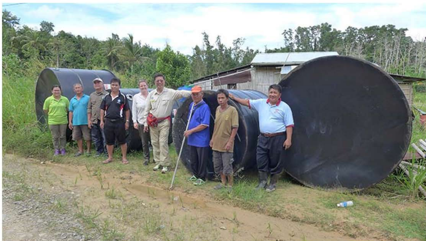
Second visit to Kg Tutuwon