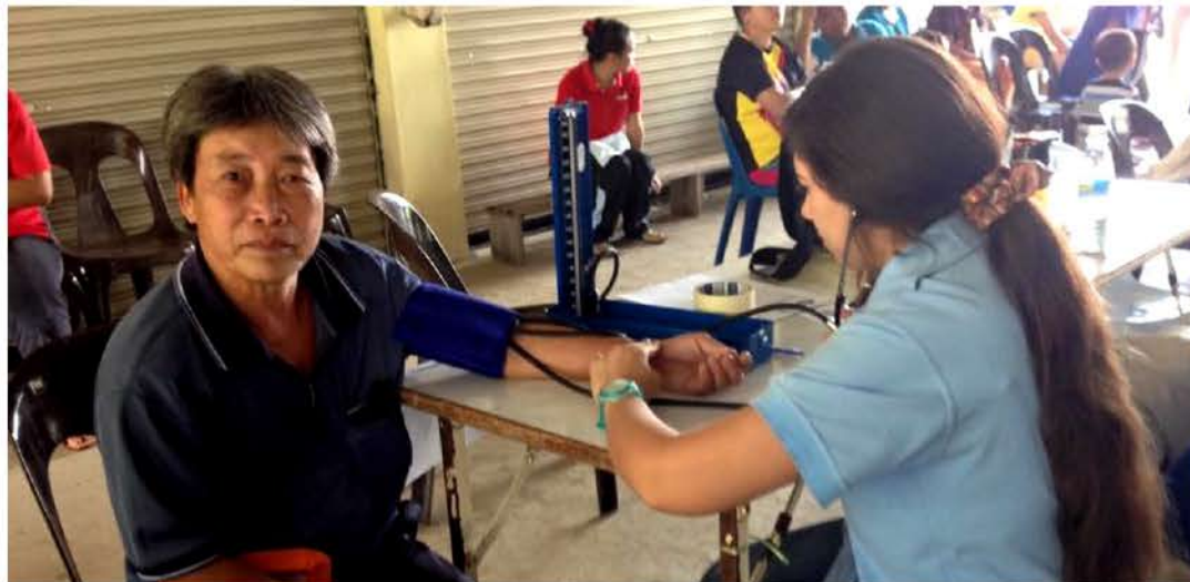
The Kiau village headman getting medical check-up