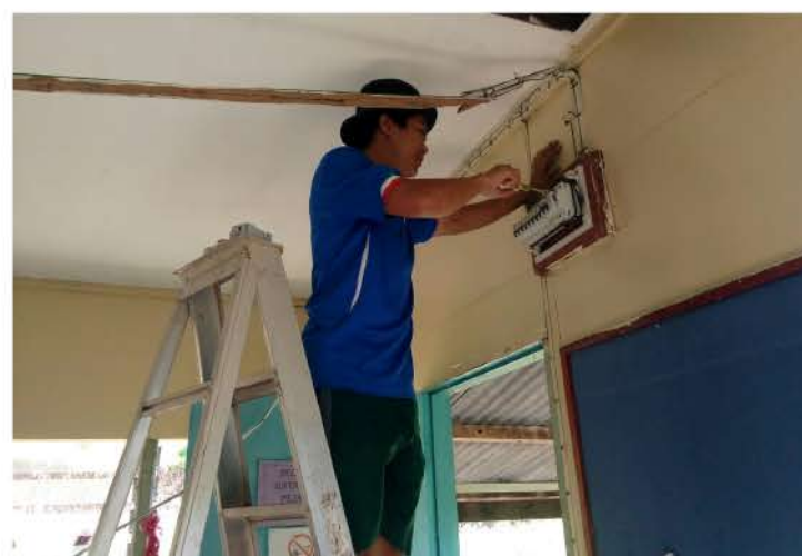
Electrician is rewiring