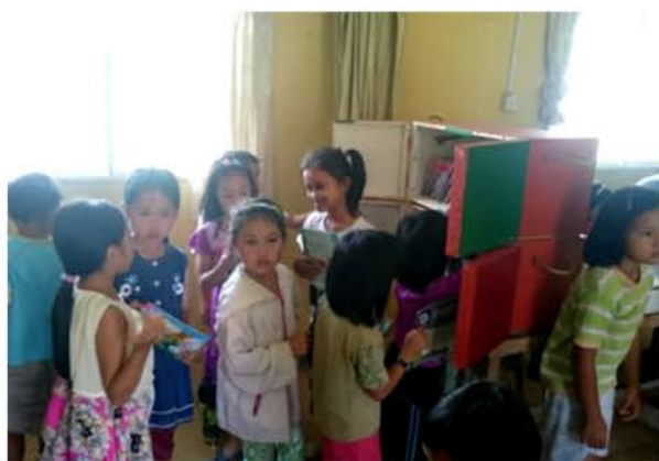
Children enjoying the Reading Bus Program