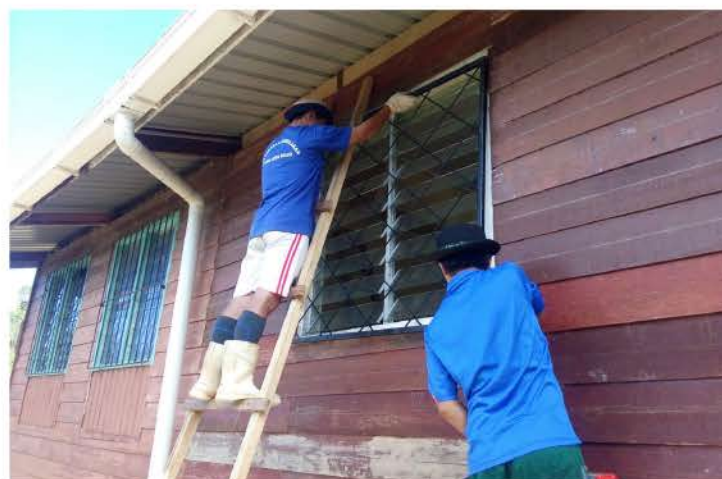
Installing the grill