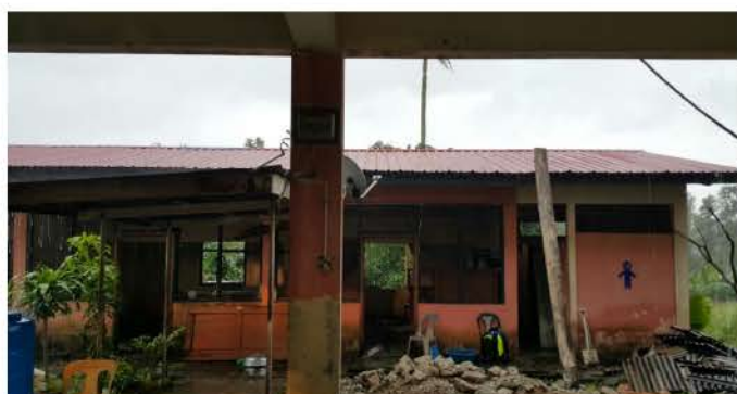
ABJC – Kitchen (Before)