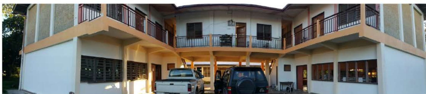
The newly painted ABJC Hostel