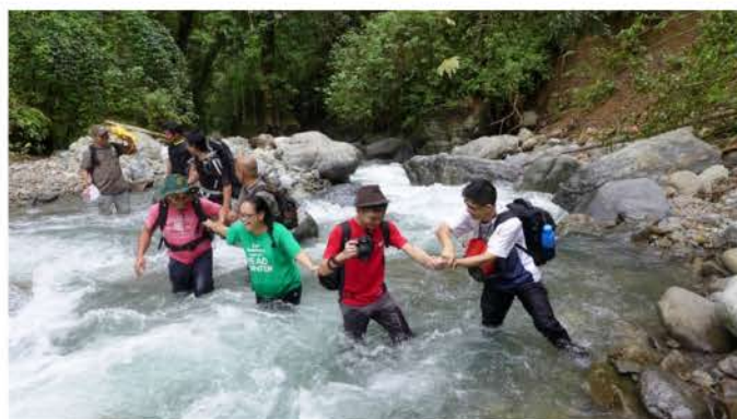
Youths from SkyCommunity crossing the Kedamaian River