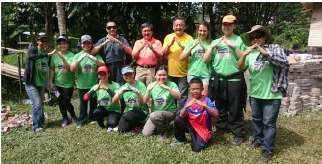
The girls with the Habitat for Humanity Board of Directors

BEST Society and Borneo Eco Tours will continue to help by sending another group next time.