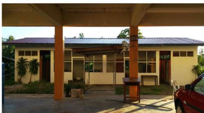
ABJC – Kitchen (After)